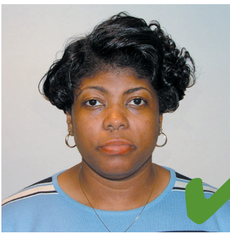
New Passport Style Photo